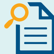
Ample Publication Nationally & International in Rehabilitation Sciences