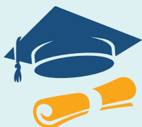
Pioneer Start DPT Degree in Pakistan

We warmly welcome you to learn in a conducive environment from our highly qualified faculty at Riphah.