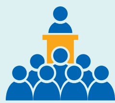
Organized International Conference in Rehabilitation Sciences