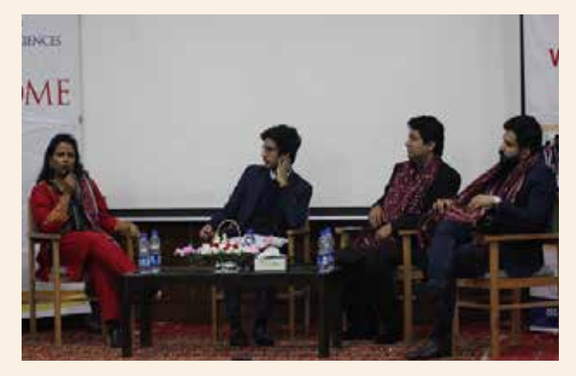
"Panel Discussion on Youth Empowerment"