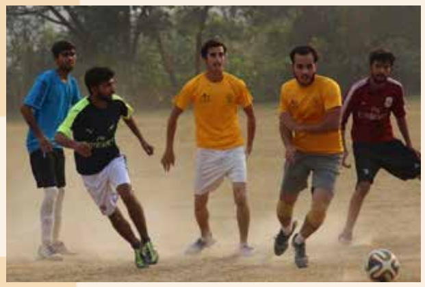
Highlights of Industry Academia Linkages