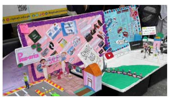
Performance Day Projects of Students, Fall 2022