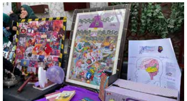
Performance Day Projects of Students, Fall 2022