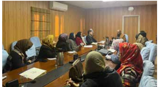
Workshop on Outcome Based Education for Faculty