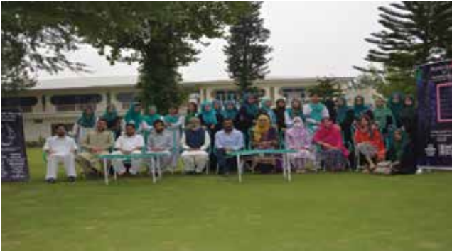
Recreational Trip for DELL students at Swat River Bank, Malakand