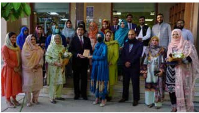
Farewell of Faculty, 2022