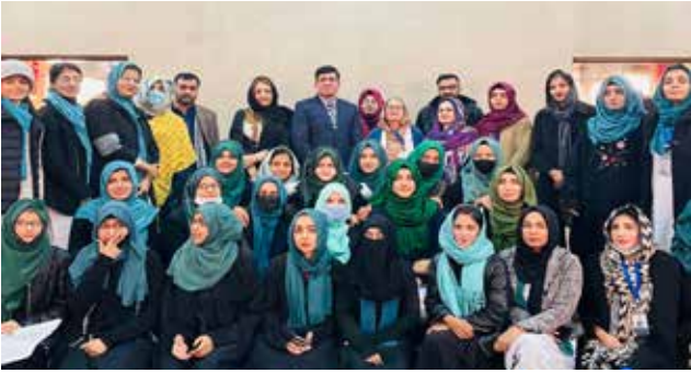
BS Performance Day at Gulberg Green Campus, Fall 2022