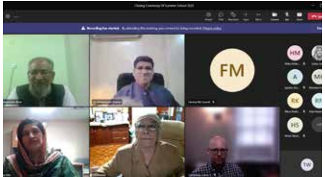
Online Summer School, 2022