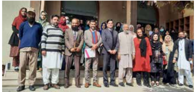
BoS Approval Meeting for PhD Program at DELL-Riphah, Islamabad Campus held on December 22, 2022