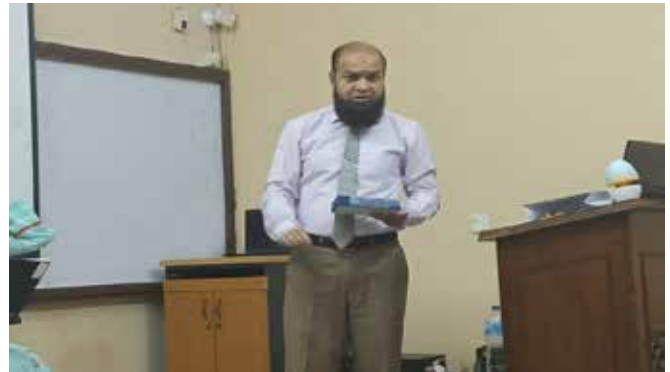
Seminar Series for MPhil Students at DELL