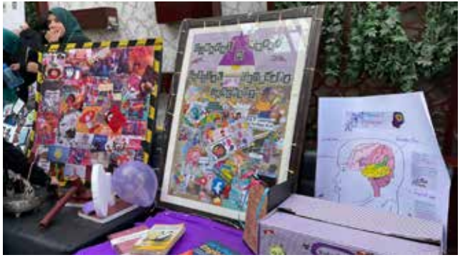
Performance Day Projects of Students, Fall 2022