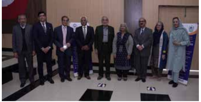
International Conference on Applied Linguistics Organized by DELL, Held on March 11-12, 2023.