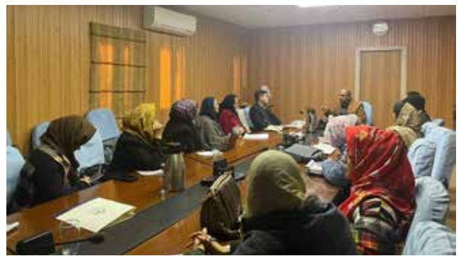
Workshop on Outcome Based Education for Faculty