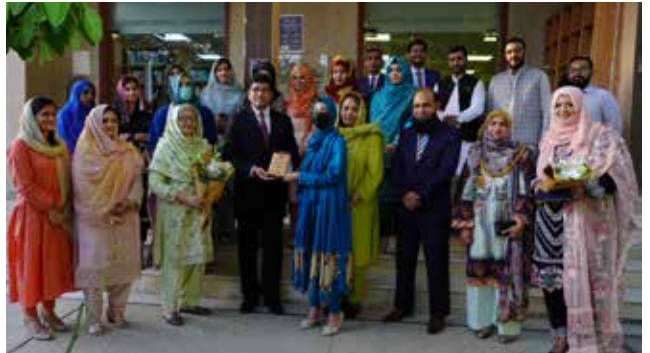
Farewell of Faculty, 2022