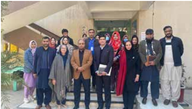
MPhil Orientation Session, Spring 2022