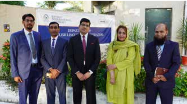
Welcome for New Faculty, 2022