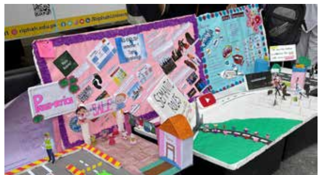
Performance Day Projects of Students, Fall 2022