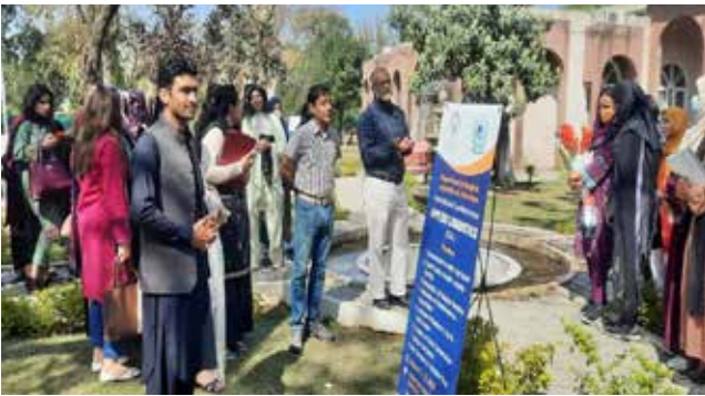
MPhil students Discussing the Research Ideas During ICAL-23