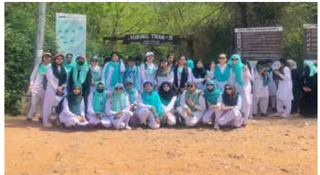
Educational Trip of DELL Students to Trail 5