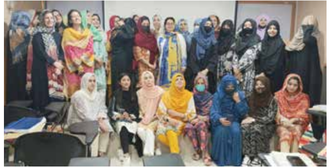
MPhil Students, Spring 2023