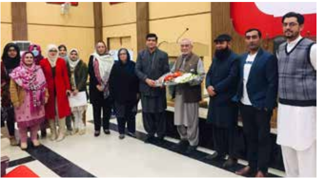
Seminar with Vice Chancellor, 2022