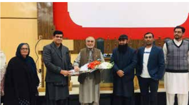
Seminar with Vice Chancellor, 2022